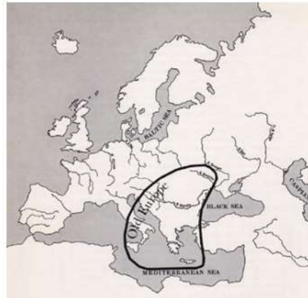
Fig. 1. A map of Old Europe (after Gimbutas 1974, 16, Map 1). 1 pav. Senosios Europos žemėlapis (pagal Gimbutas 1974, 16, I žemėlapis).

My focus is on her archaeological contributions, including her arrival and involvement at UCLA, and her research publications before she organized an excavation in southeast Europe. Marija Gimbutas' 'kurgan' hypothesis, i.e. the Early Bronze Age arrival in Europe and the impact of * Proto-Indo-